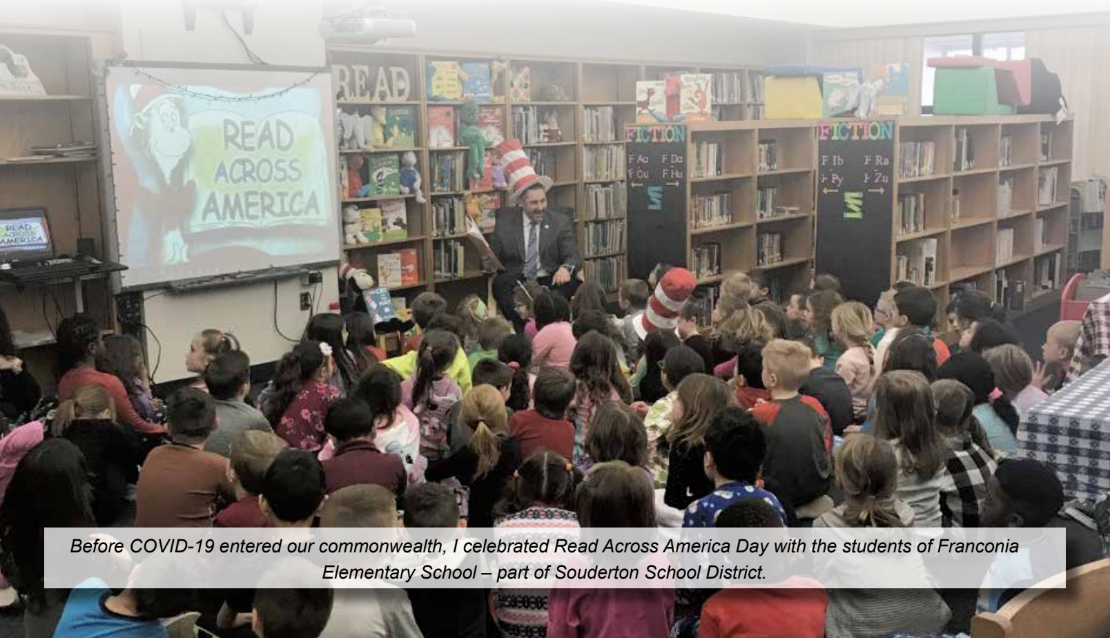
Before COVID-19 entered our commonwealth, I celebrated Read Across America Day with the students of Franconia Elementary School – part of Souderton School District.